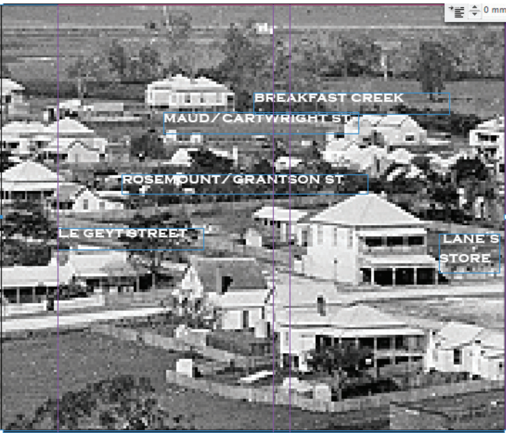
BOWEN BRIDGE ROAD, O'CONNELL TOWN - IN THE BACKGROUND, LEGEYT STREET. LANE'S STORE.

strasburg beef and sausages veal and ham, brawn, chicken and ham in tins, luncheon beef, braised shoulder of mutton, potted hams, pigeons, spiced ox-cheek, haricot ox-tail, Brighton hunting beef, luncheon beef, Oxford sausages, picnic pies.