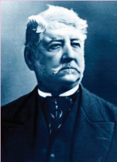
Sir Arthur Kennedy, K.C.M.G.

Governor of Queensland Supplier of Skinner's Turtle Soup