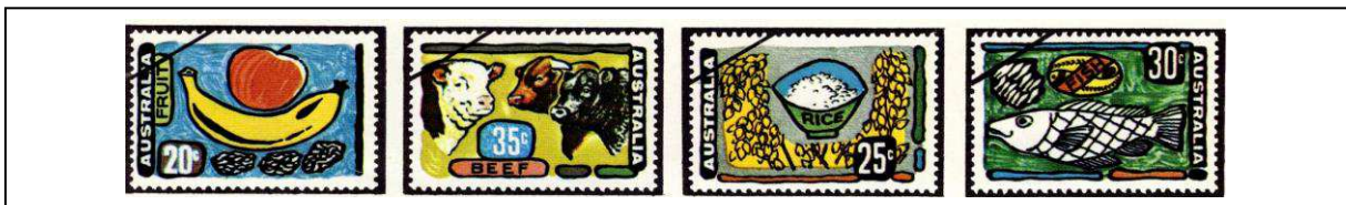
Primary Industries Stamps – June 1972 (Australian Post Office Philatelic Bulletin)